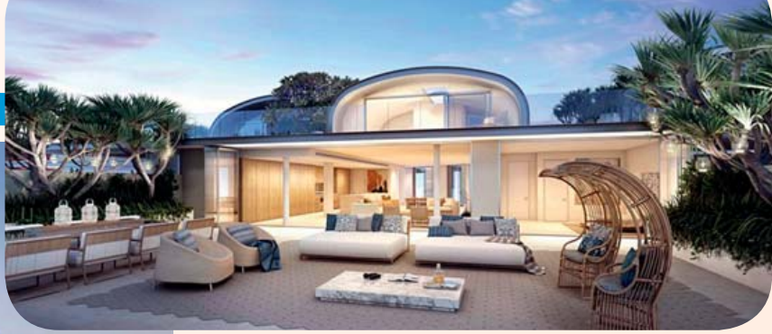
ABOVE: The penthouse apartment was originally two units bought off the plan and amalgamated at the owner's request.