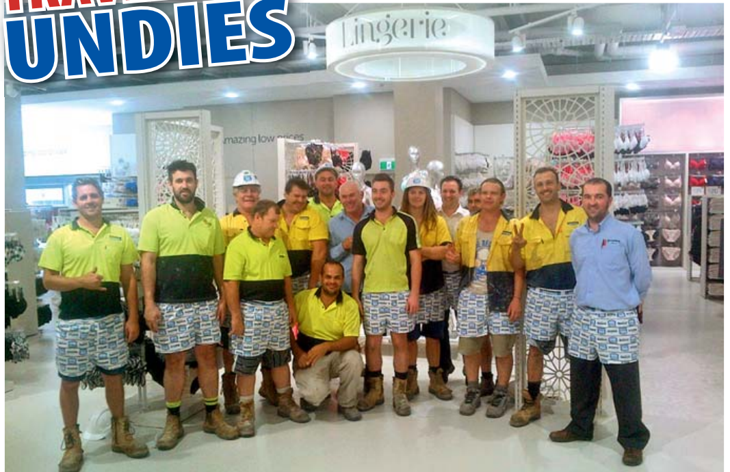
Hutchies' team members seem to have an unusual fascination for ladies' lingerie. Last edition it was Hutchies' Target Mount Gravatt team at the opening of that store and this time its Hutchies' Target Pacific Fair team flaunting the fashion at their hand-over on the Gold Coast.