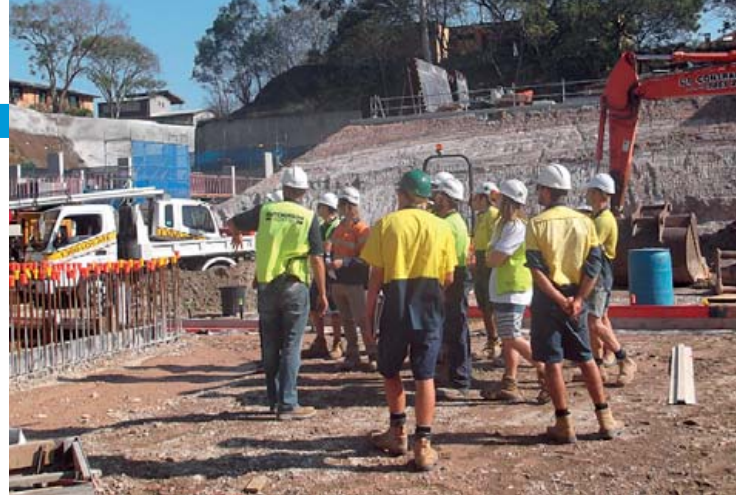
Regular Friday afternoon site visits were an invaluable aspect of the Future Leaders Program training last year.

Projects visited included: a high-rise development where the apprentices were exposed to