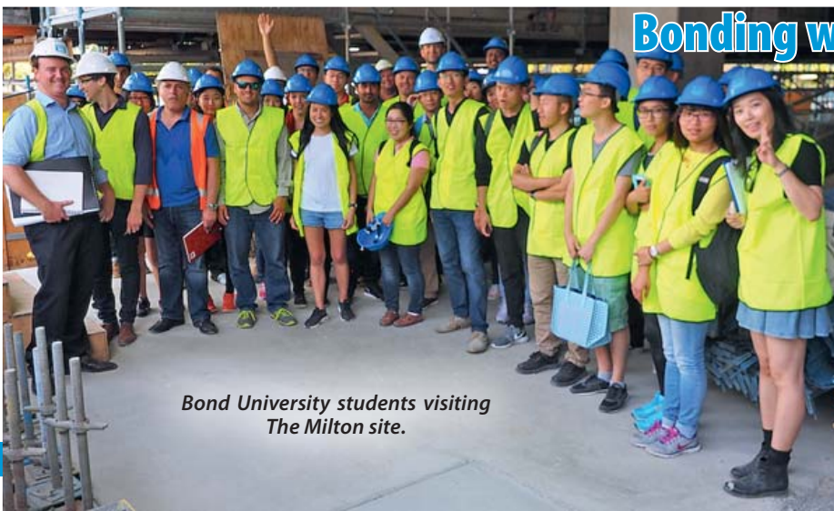
Bond University students visiting The Milton site.