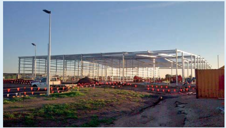
The Condabri SP7 Laydown and Warehouse is located near Miles (Qld) and is part of the APLNG Upstream Phase 1 Gas Facilities project

Job Description: Located next to the Go Between Bridge in South Brisbane, on completion, Spice Apartments will consist of five levels of car park – two below ground and three