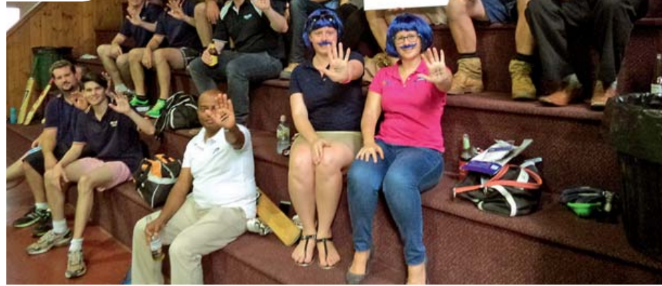
Team members and spectators at Hutchies versus RMA annual Indoor Cricket Challenge showed their support for the Hands Off campaign.

The annual cricket match was staged at the Toowoomba Indoor Sports Centre in November.