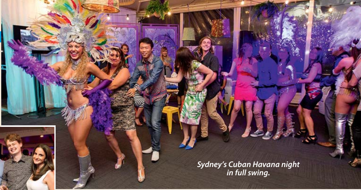
Sydney's Cuban Havana night in full swing.