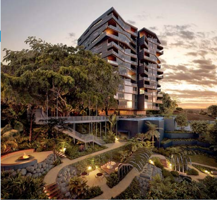
Artist's impression of The Highgate. Site work involves protection and working around five protected fig trees.

of slip lanes, service diversions, bus stop and roundabout.