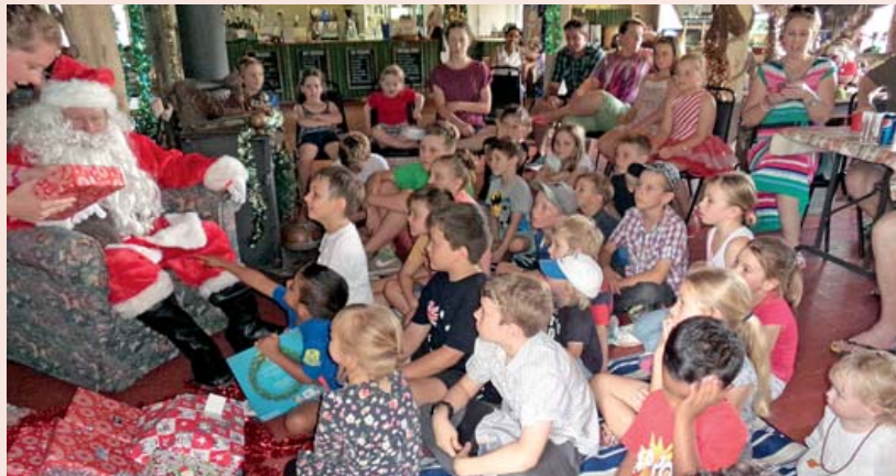
LEFT: Santa also visited Toowoomba when the kids' party was held at The Barn at Flagstone Creek.