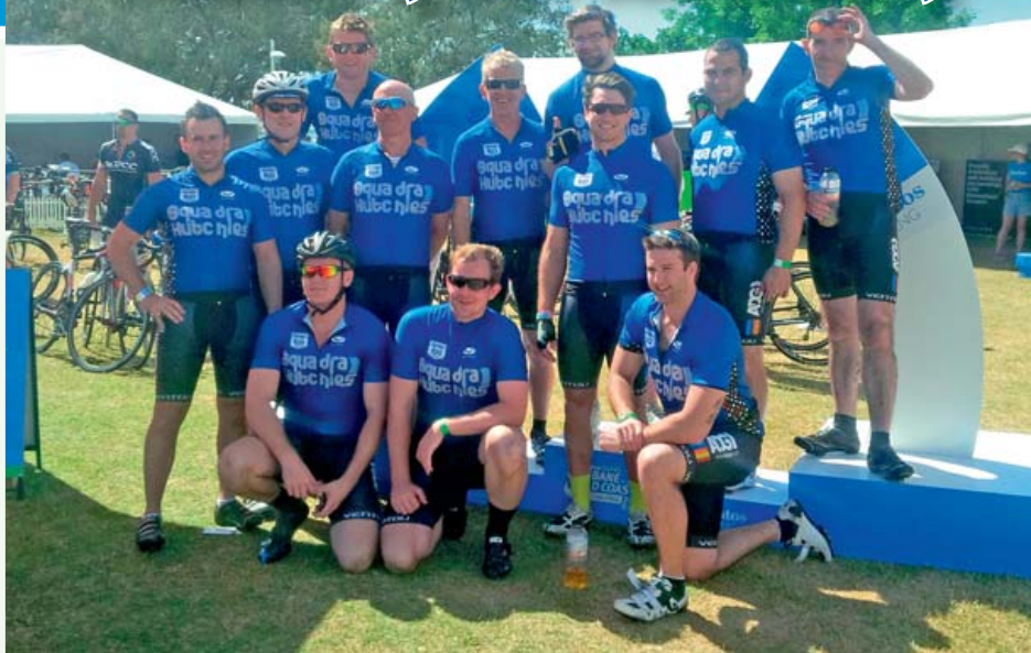
Riders of the combined Hutchies/ADG team.

HUTCHIES' team members were among more than 7000 riders who took part in the Santos GLNG Brisbane to the Gold Coast Cycle Challenge, Queensland's biggest and best bike ride.