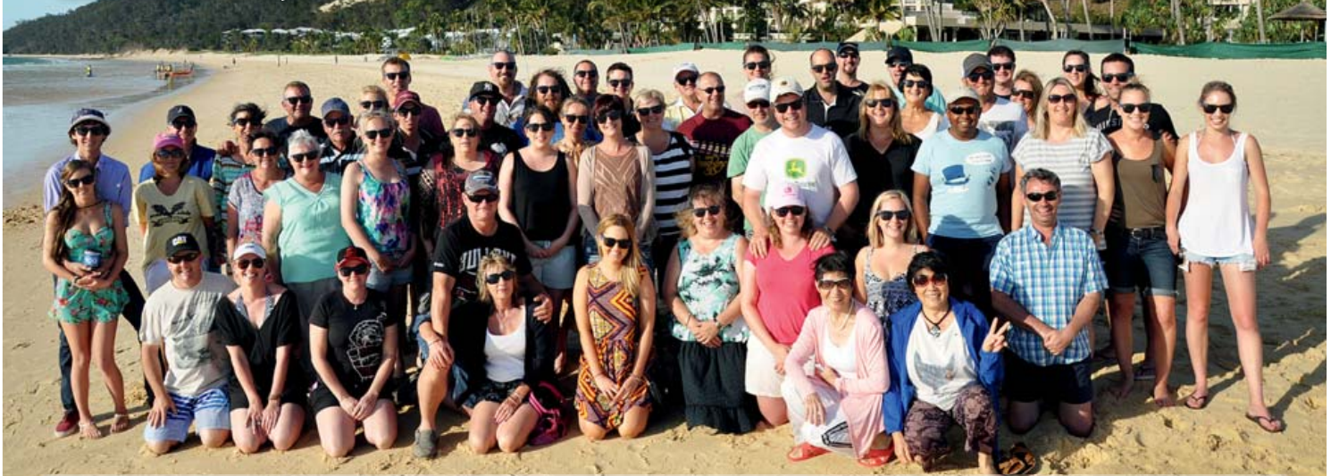
HUTCHIES' Toowoomba social club recently invaded Tangalooma resort on Moreton Island for a weekend of fun and frivolity. Beach cricket, swimming, sand tobogganing, sunset cruise, dolphin feeding, wining and dining and karaoke were just some of the activities that took place!