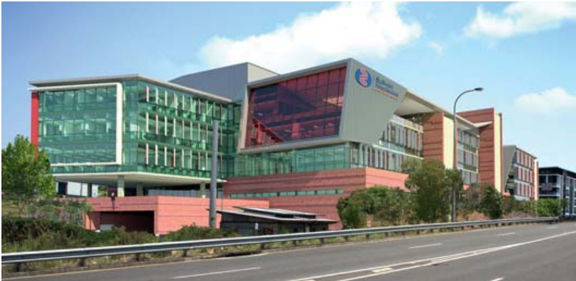
Concept image of the new Sullivan Nicolaides Pathology central laboratory facility at Bowen Hills, Brisbane.

HUTCHIES has started construction on the new Sullivan Nicolaides Pathology (SNP) laboratory headquarters at Bowen Hills in Brisbane which will be the most advanced facility of its kind in the southern hemisphere.