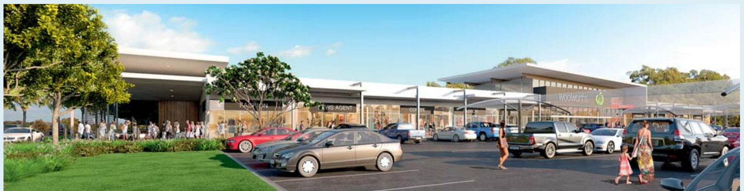
Artist's impression of the new Woolworths and other associated retail outlets under construction in Bakewell, Northern Territory.

Job Description: Project is the design and construction of a new Woolworths store and nine associated specialities which includes provision of serviced building pads for future development of a new fuel station and McDonalds restaurant, and AC paved car parking and ridge steel car park shade structures. Extensive external road works to service the completed facility to be carried out consisting