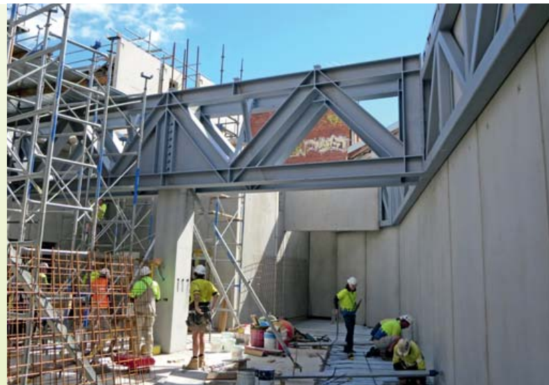
Floor trusses in place for the new Myer Hobart development.